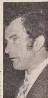
● Cr OAKLEY details of its inquiry proposal to all metropolitan municipal councils for comment and decision.

Following the passage of Cr Oakley's motion, Nunawading will send