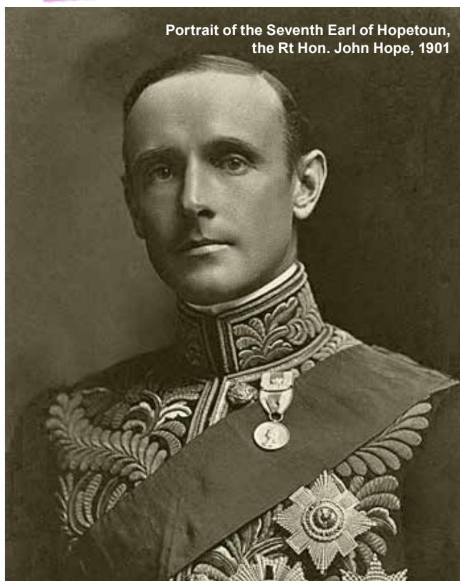
Portrait of the Seventh Earl of Hopetoun, the Rt Hon. John Hope, 1901