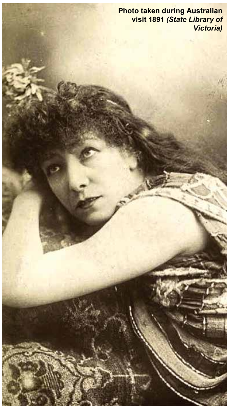
Photo taken during Australian visit 1891

Although but a fleeting stay locally, the Box Hill Reporter made the most of a legendary actress's visit in 1891.