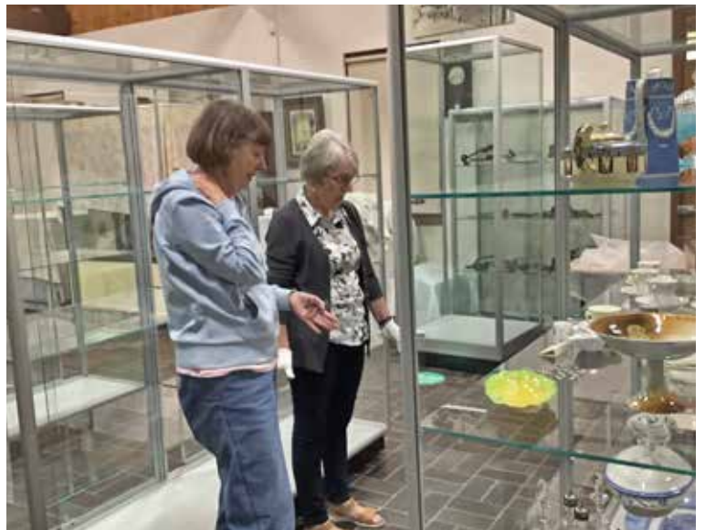
PICTURES (clockwise from top left): The cases arrive; cases installed in the museum; designing the Afternoon Tea display.

More working days to come – and watch this space for more news.