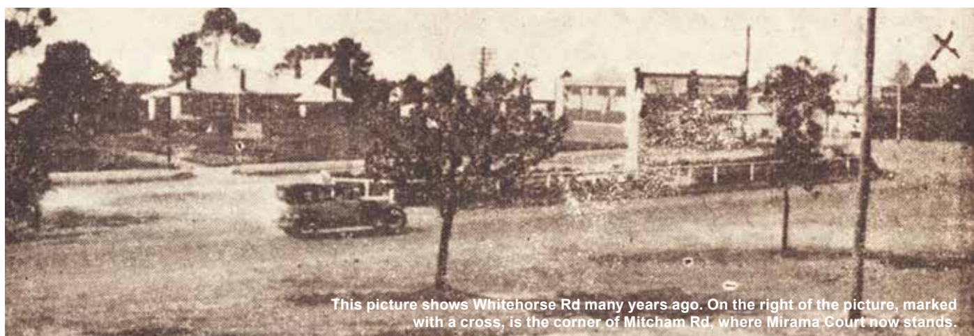
This picture shows Whitehorse Rd many years ago. On the right of the picture, marked with a cross, is the corner of Mitcham Rd. where Mirama Court now stands.