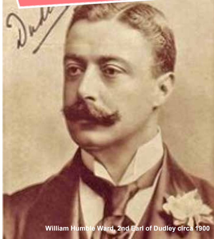
William Humble Ward, 2nd Earl of Dudley circa 1900